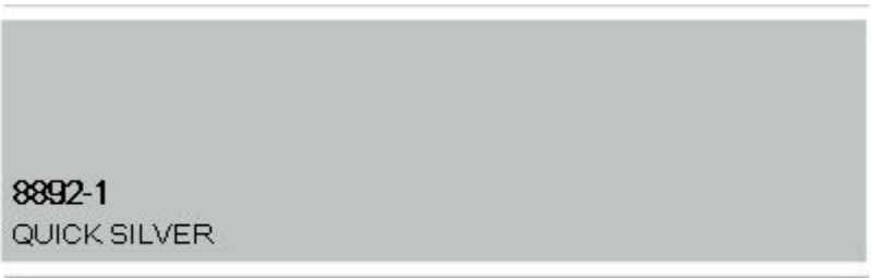
This picture is for illustration purposes only.